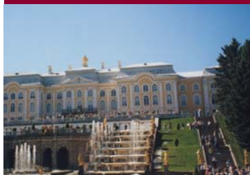
Palace of Peter the Great outside St. Petersburg, Russia