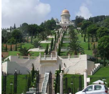
Ba-Hai Temple in Haifa, Israel