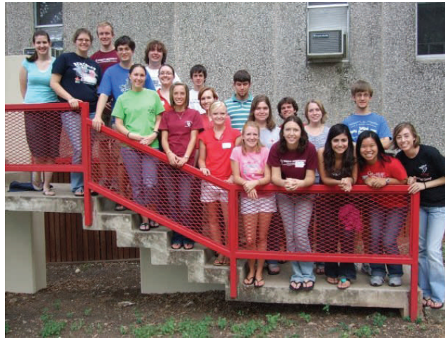
Gathered for a picture at the end of our Fall Retreat "Heaven on Earth"

As for what we do, we have Mass on Sunday nights at 8:00 pm. On Mondays we pray the Ro-